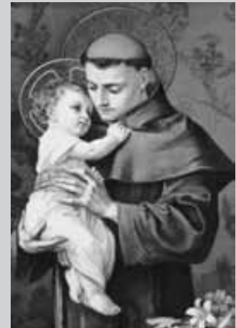
St. Anthony of Padua

Masses: Saturday 5:00 p.m. Sunday 8:30 a.m.