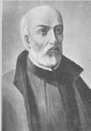
St. John de Brebeuf